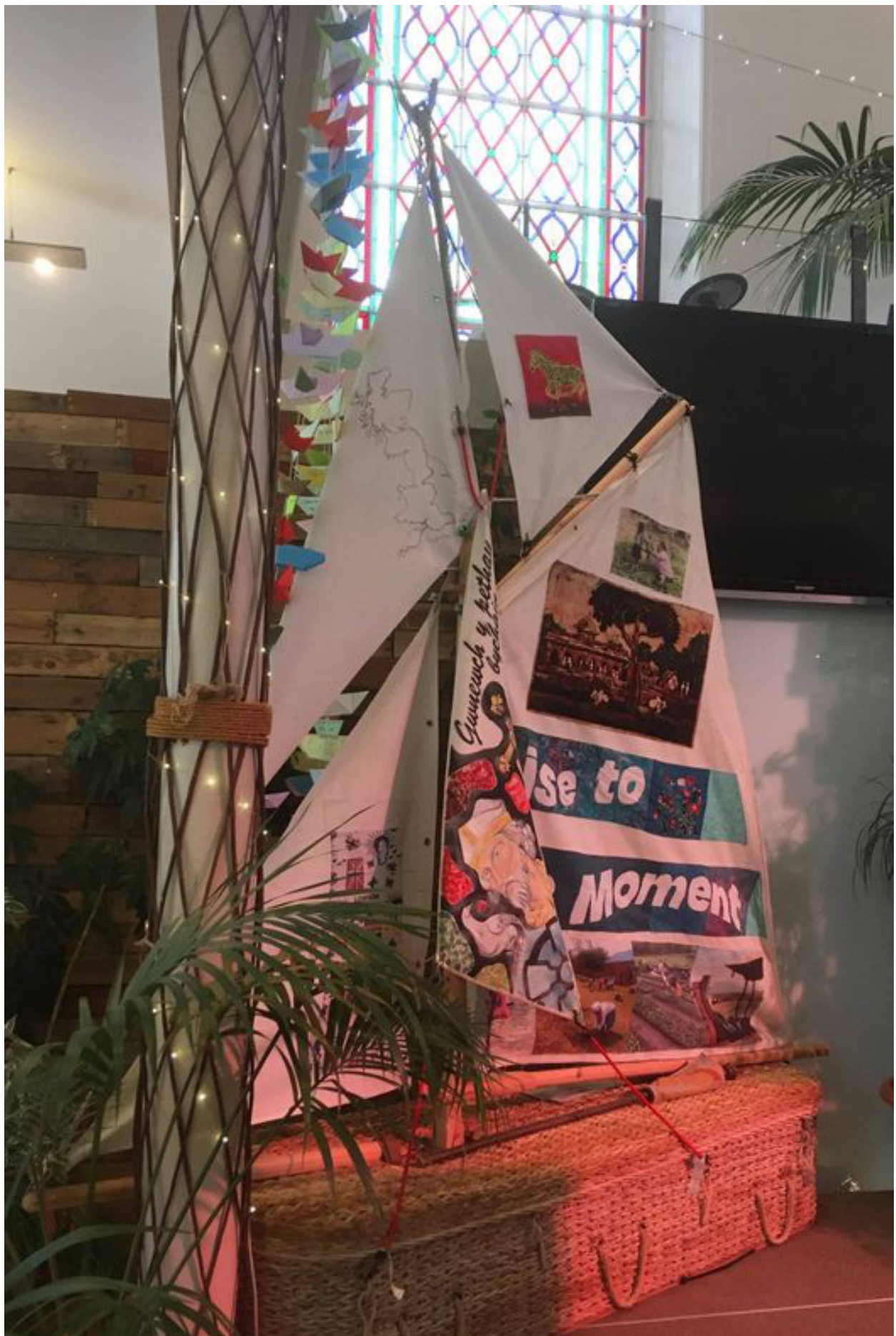
Rise to the Moment Pilgrim Boat